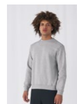
EXISTS IN UNISEX: B&C SET IN